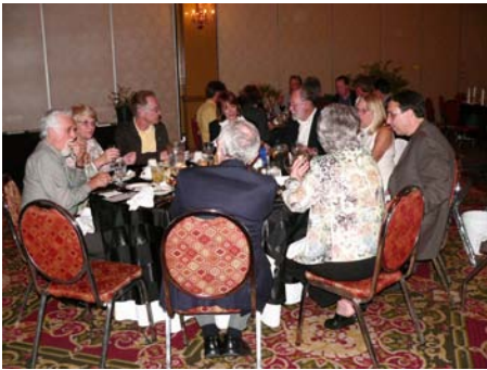
One of the YAMA KI tables