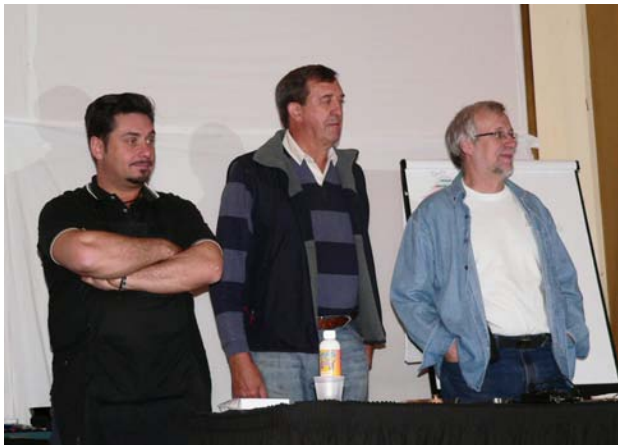
The three artists enjoying the applause!