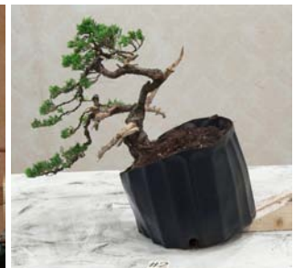
Winning bonsai (#2)