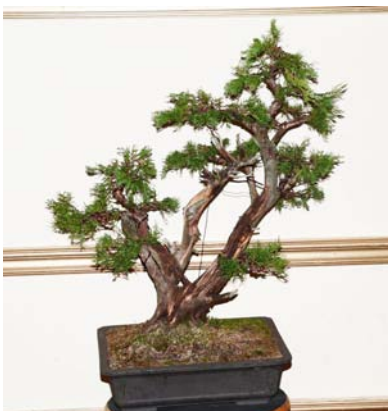
Ready for the winning bid!