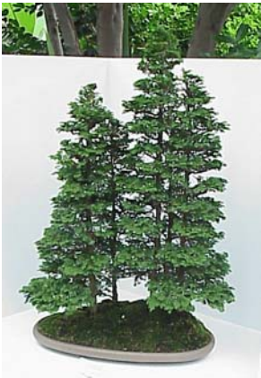
Hinoki False cypress