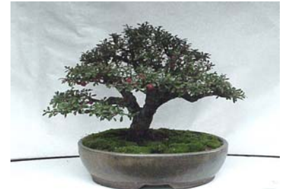
Little leaf Cotoneaster