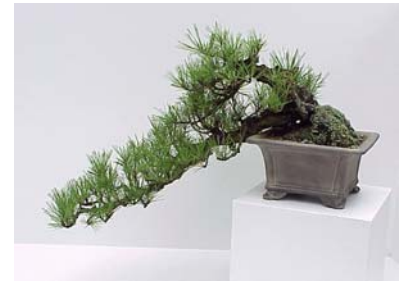
Japanese black pine