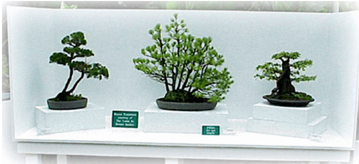
A typical Tokanoma