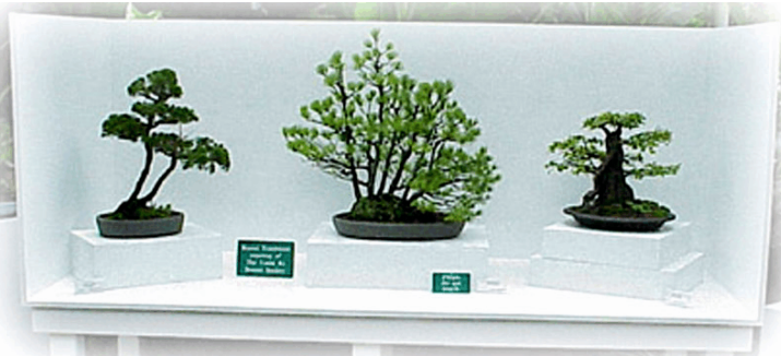
A typical Tokanoma