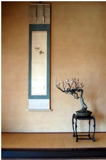
A Tokonoma display Sean assembled in Japan

Even if your trees aren't ready for formal display, Sean can help us to learn what to look for when buying display pieces and how to show our trees at their best at home.