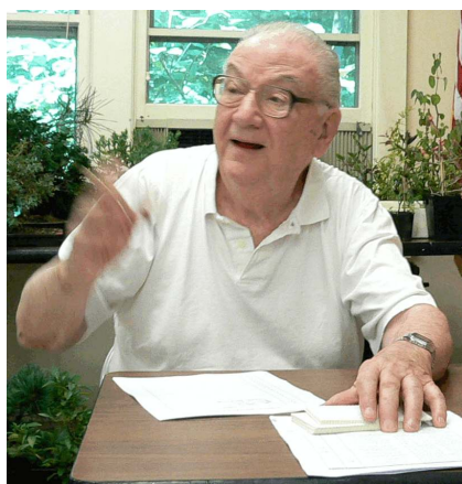
Irv's "What Number?"