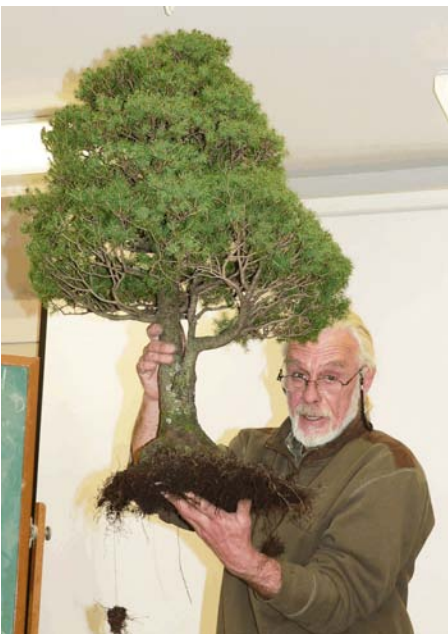
Rootball reduced and flattened