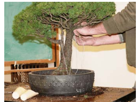
Tying string for traveling