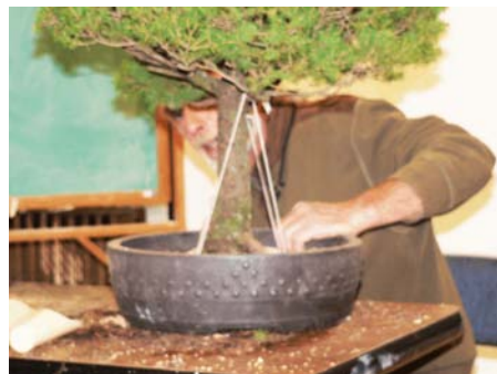
Condensing & compressing soil