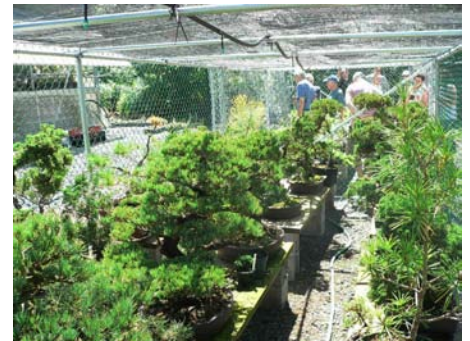
Bonsai available for sale

Susan tried positioning her large Adenium obesum in many ways, seeking a balanced composition while still exposing the root structure.