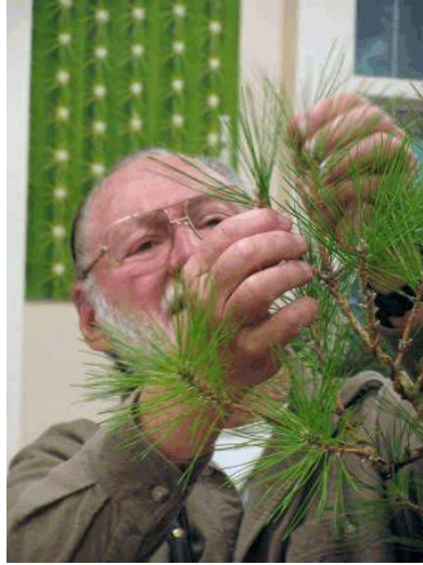
How to & when?