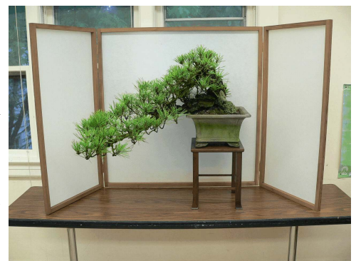
Berni’s corkbark Black Pine grafted 35 years ago

* This document too large, attachments emailed separately.