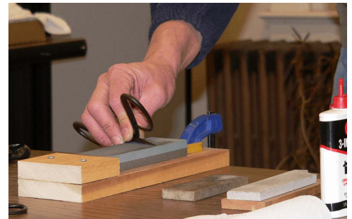
A self-made “cradle” to support and stabilize the stone