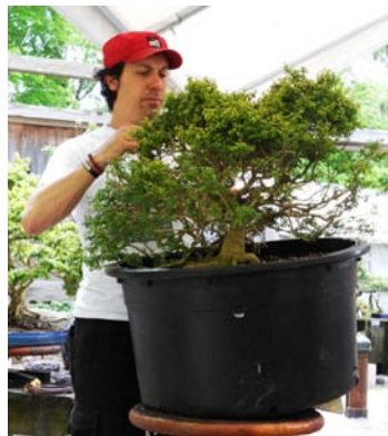
Pruning, joking, teaching