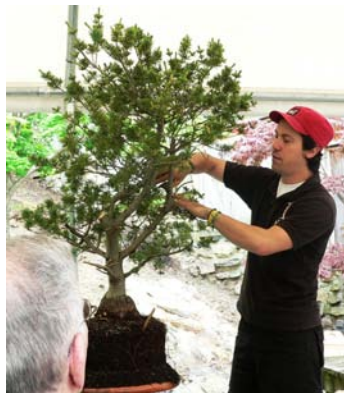
Pruning the obvious