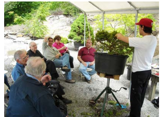
YAMA KI members at attention