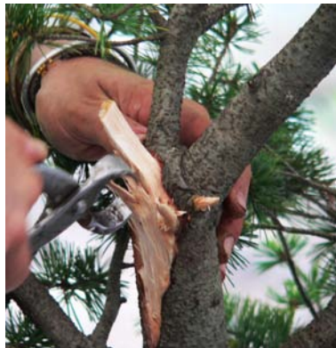
Ripping to create shari