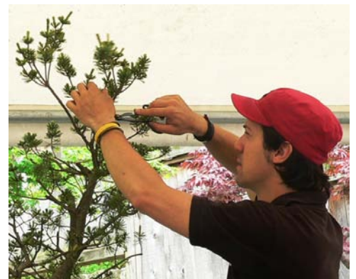
Discussing 5 needle pines & buds