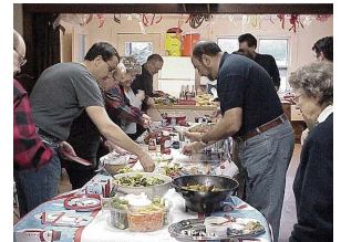
Remnants from last year's buffet

The luncheon requires you to bring a dish: appetizer, salad, main course, or desert. Call or email either Gail Therrien (914-244-1320/ galtbon@aol.com ) or Rhoda Kleiman (212-724-7840/ irkleiman@rcn.com ) and let us know what you will bring (to avoid 3,000 pieces of sushi without a main course, etc. The plates, napkins, flatware, and cups are all on site. You can also volunteer to help set up (11:30 a.m. at the Bartlett) and/or clean up when you call about your buffet contribution. Come greet old friends, meet new members, shop with friendly competitors, and rejoice in bonsai bonanzas.