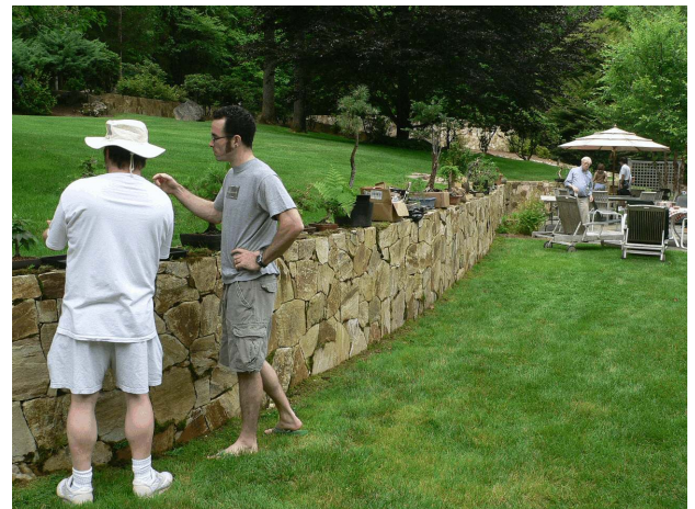
Viewing some of the auction materials

The day was sunny and most of us came early so there was plenty of time to review the auction material. The plants ranged from pre-bonsai to bonsai created by international artists which were purchased by YAMA KI for the artists’ demonstration material. Of course there was a large assortment of containers, trays, books, magazines, and a few tools.